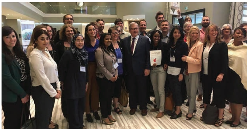
Minister Lawrence MacAulay with participants at the National Food Policy Summit

Some participants noted that the cost of food in Canada relative to income is comparatively low on a global scale. There were mixed views on the use of the term “affordable” in this theme. Some stakeholders felt that pursuing affordability of food could either impede production of food or the ability of farms and food businesses to earn reasonable profits. Although affordability was seen as extremely important by some participants, especially those from isolated, northern communities,