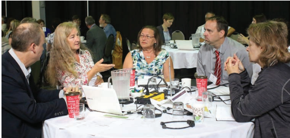
Charlottetown regional food policy consultation

Some input received indicated that sustainable growth helps to build public trust of the agriculture and food industry. In separate consultations on the Canadian Agricultural Partnership, the agriculture and food sector also indicated that building public trust should be a key focus in the next agricultural framework. The sector noted that: while public trust is slow to build, it can be eroded very quickly; consumer education and awareness activities are critical to building public trust; and programming should be reflective of this important need.