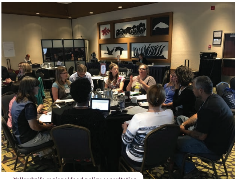
— Yellowknife regional food policy consultation

Participants emphasized the importance of community-led and community-based approaches to food insecurity for all regions and communities in Canada, including urban areas. Many participants indicated that local residents are best placed to identify their community needs, and referred to specific community-led solutions currently underway across Canada as best practices. These initiatives often have additional benefits, such as hands-on education, and linkages to food literacy and economic development. Participants perceived a need for these solutions to be supported, including through the sharing of best practices with other regions experiencing similar issues.