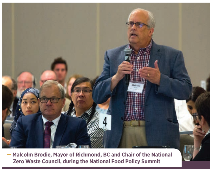
— Malcolm Brodie, Mayor of Richmond, BC and Chair of the National Zero Waste Council, during the National Food Policy Summit

Participants expressed strong concerns about the contribution of food loss and waste to greenhouse gas emissions, which in turn contribute to climate change. Some indicated that success in reducing food loss and waste could help Canada meet its commitments to reduce greenhouse gas emissions under the Pan-Canadian Framework on Clean Growth and Climate Change, and could contribute to achieving