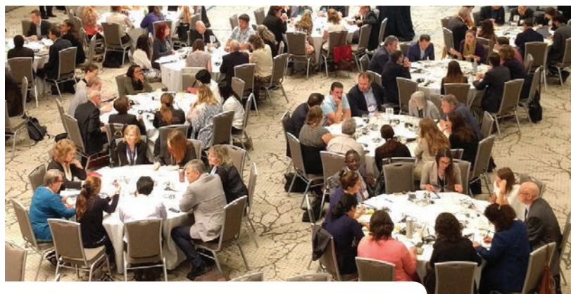
— Table discussions during the National Food Policy Summit

Summit participants expressed broad support for the elements included in these draft statements. They emphasized the importance of including people, systems and leadership in a vision statement, along with food security and protection of the environment. They also signalled that the policy's vision statement should acknowledge the importance of culturally-appropriate food, encompass all parts of the food system, and recognize the linkages among food, health, the environment, and economic growth.