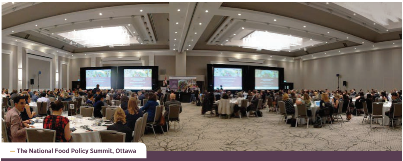
— The National Food Policy Summit, Ottawa

With this in mind it is important to note that input was wide-ranging, broad-based, and not always consistent. The report aims to reflect the essence of the ideas and perspectives that were raised during the consultation process but does not attempt to include every comment received and it does not intend to imply consensus on the part of all participants. It presents a summary of what was heard from consultation participants – key messages, perceptions, and suggestions for the food policy. The views expressed are those of participants in the consultation process and should not be construed as representative of the Government of Canada's positions or views.